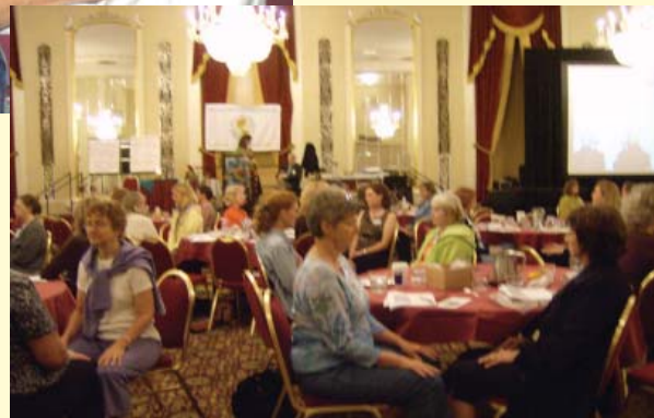
Centering in the Heart