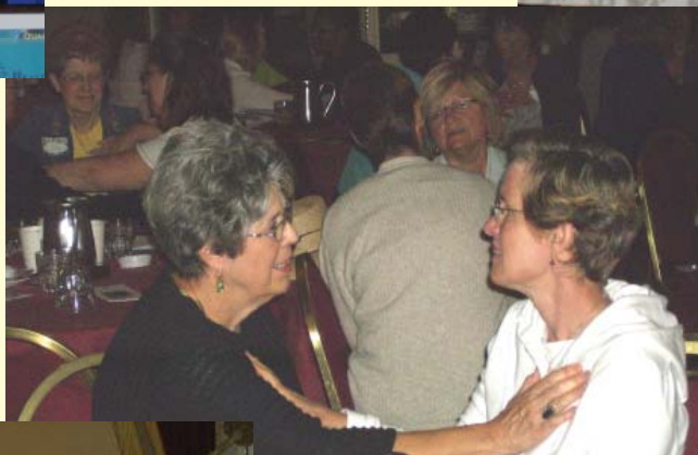
The Heart-to-Heart Connection