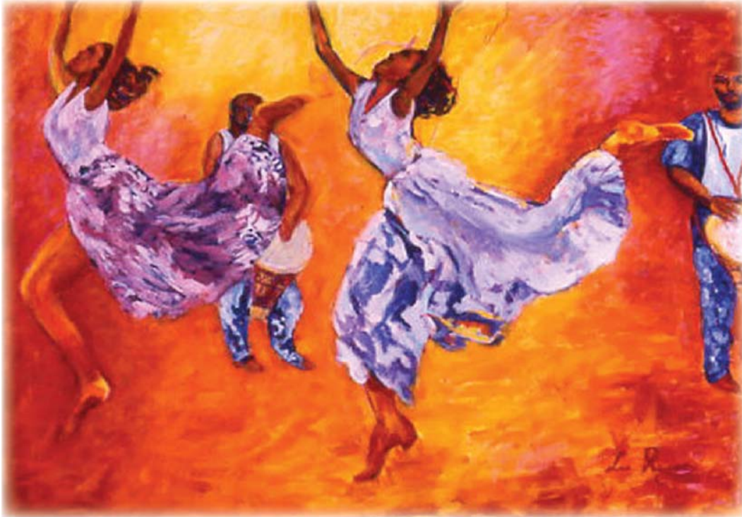
“Celebration” by Lee Rumsey

Join us as we explore the use of flow in support of globally healing (thinking globally!) through our personal development and work of Healing Touch (acting locally). To submit a workshop or poster proposal, visit our website, www.HealingTouchInternational.org and select Healing Touch International Conference .