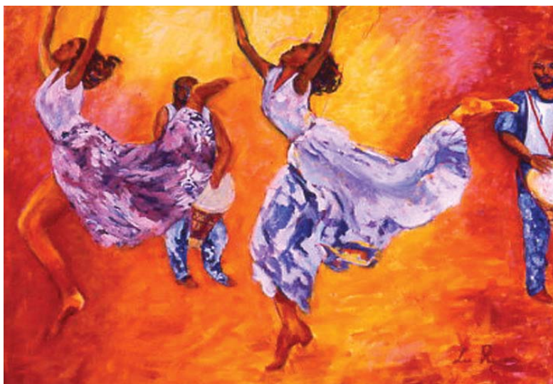
"Celebration" by Lee Rumsey

"Flow is the natural, effortless unfolding of our lives in a way that moves us toward wholeness and harmony. When we are in flow, occurrences line up, events fall into place, and obstacles melt away. Rather than life being a meaningless struggle, it is permeated with a deep sense of purposefulness and order. Flow has tremendous power to transform our lives, for it is dynamic and moves us unerringly toward joy and aliveness."