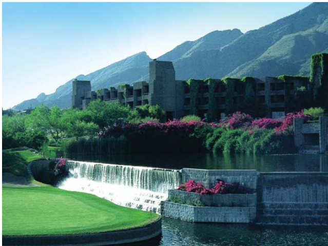
Loews Ventana Canyon Resort in Tucson Kivas at Loews Resort