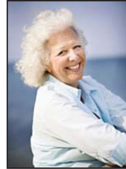
Belleruth Naparstek LSW, Pioneer in the Field of Guided Imagery