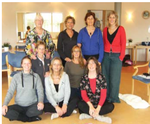
Level 2 Class