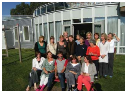
Level 3 Class

The didactic lecture portion explaining Healing Touch is generally received mentally. The fun starts with the experiential portion, introducing grounding and centering and observing the calmness and serenity that softens the faces. When the participants are feeling the energy in their own palms, the expression of curiosity begins to appear across the brow. When expanding the experiential exercises to "playing with the energy" of a partner's hands, the looks of interests and wonder spread to the eyes and mouth as smiles begin to form.