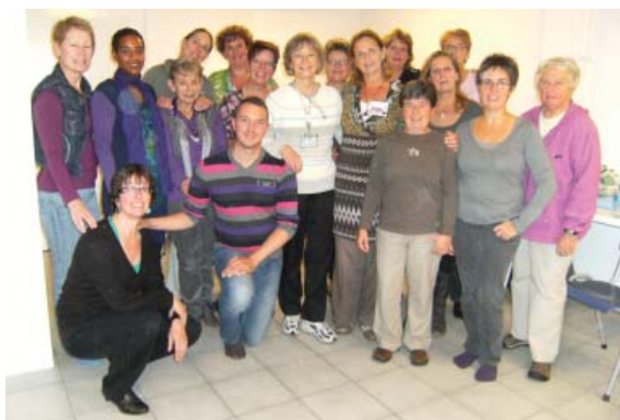
Level 1 Class