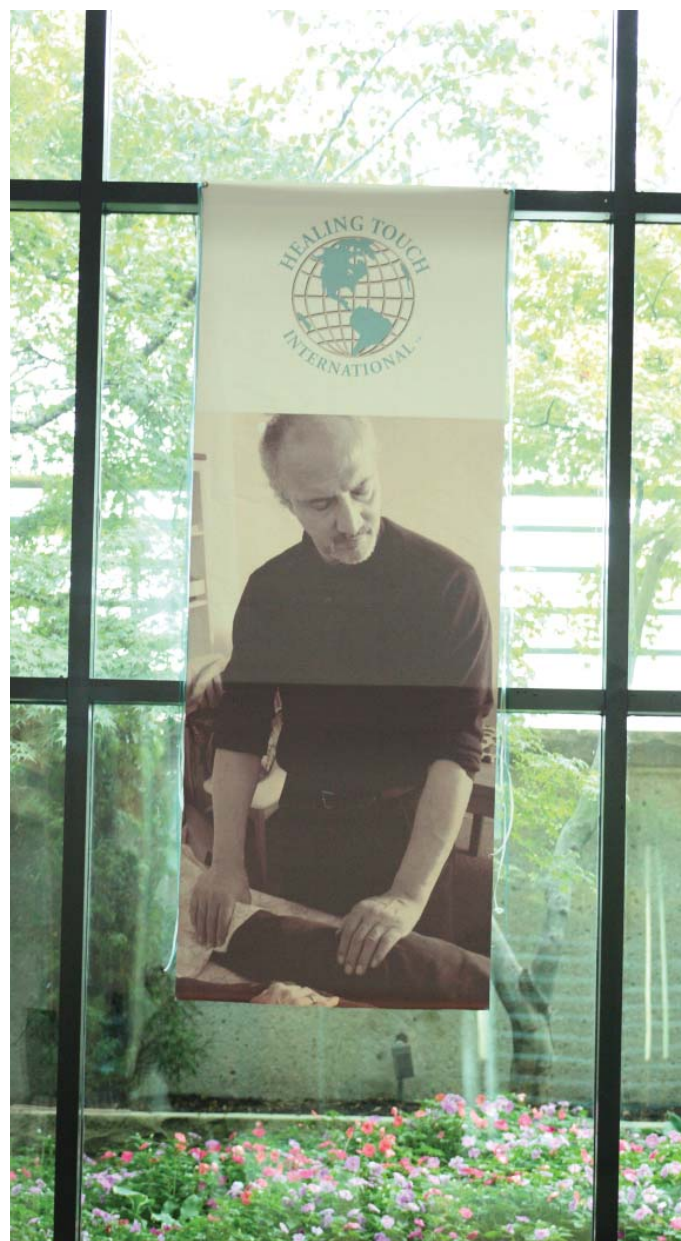
HTI Mini Banner