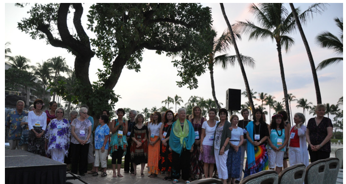
Pinning Ceremony 2011 - Hawaii Join Us as we Acknowledge our Graduated and Newly Certified Practitioners 2012 - Colorado